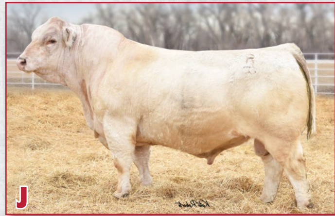
J RBM FARGO Y111 Polled Reg. #: EM809088