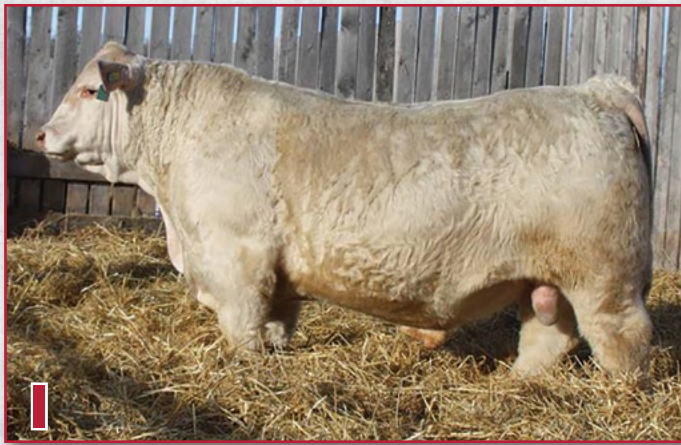
I HTA CENTERFIRE 618 D Polled Reg. #: M891528