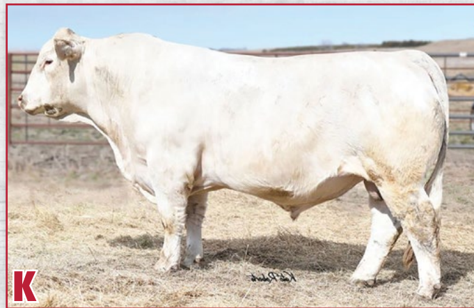
K LT RANSOM 8644 Polled Reg. #: M914463